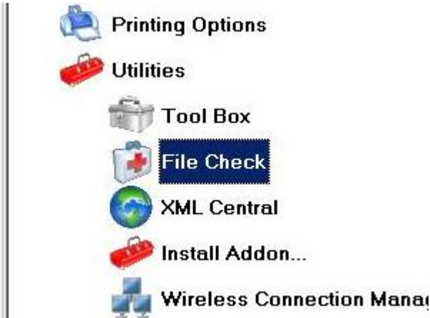
Figure 1 - File check utility.

Before making any copies of data, we need to ensure that all users are logged out of system five. Failure to perform this check may result in loss of data after the copy has been performed. This process uses the File Check that is found in the System Five Navigator as shown in Figure 1. The File Check utility is used as it has a feature that scans for all users logged in across all System Five terminals.