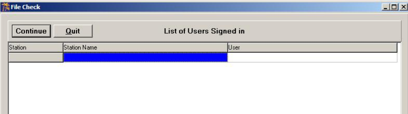
Figure 3 - No users are showing logged in

If the File Check screen shows blank as in figure 3, then all users are logged out. This screen will refresh every few seconds while users are logged on. The terminal name and user name will be displayed. Log out of the System Five used to run this file check before starting the data copy.